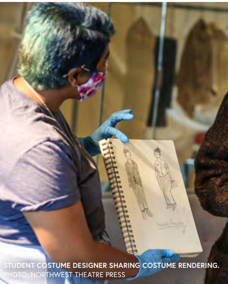
STUDENT COSTUME DESIGNER SHARING COSTUME RENDERING.