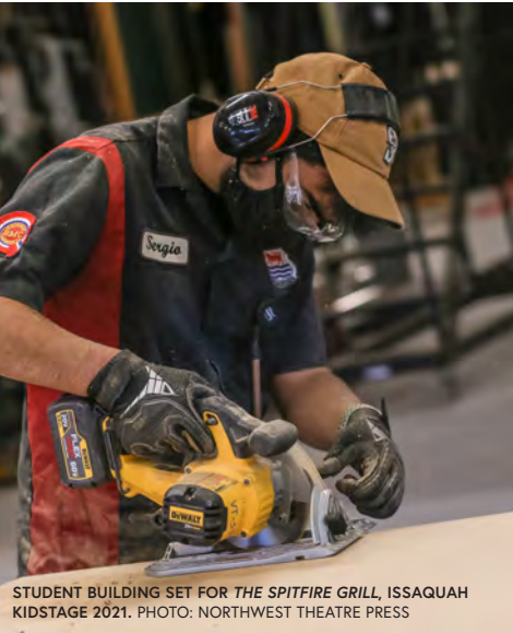
STUDENT BUILDING SET FOR THE SPITFIRE GRILL, ISSAQUAH KIDSTAGE 2021.