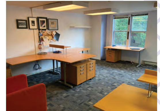
(LEFT TOP) REMODELED COSTUME SHOP; (LEFT BOTTOM) IMPROVEMENT AND CONSTRUCTION PROCESS; (ABOVE) REMODELED PRODUCTION OFFICE. PHOTOS: FRANK STILWAGNER

Village Theatre also used this period of closure to re-evaluate the schedule of our performances, with a goal to find new ways we could provide our performers, production, and technical staff with a healthy work/life balance as they work tirelessly to create the magic you see on our stages each season. Traditional theatre hours have often created long hours and weeks, and it was important for us to find an equitable solution to this challenge. We implemented a five-day work week for our performers and technical staff, and eliminated workdays that exceeded eight hours. Village Theatre is proud to support the health and well-being of our artists with these changes and will continue monitor our approach for ongoing improvement.