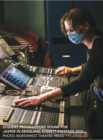
STUDENT PROGRAMMING SOUND FOR JASPER IN DEADLAND, EVERETT KIDSTAGE 2021.

Many thanks to The Boeing Company for its support of Village Theatre's STEM programming.