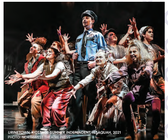
URINETOWN, KIDSTAGE SUMMER INDEPENDENT, ISSAQUAH, 2021