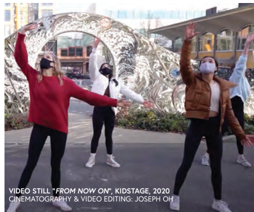
VIDEO STILL "FROM NOW ON", KIDSTAGE, 2020 CINEMATOGRAPHY & VIDEO EDITING: JOSEPH OH