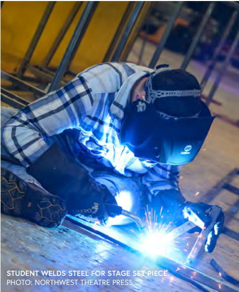
STUDENT WELDS STEEL FOR STAGE SET PIECE.