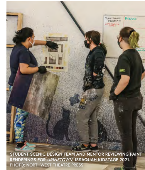
STUDENT SCENIC DESIGN TEAM AND MENTOR REVIEWING PAINT RENDERINGS FOR URINETOWN, ISSAQUAH KIDSTAGE 2021.