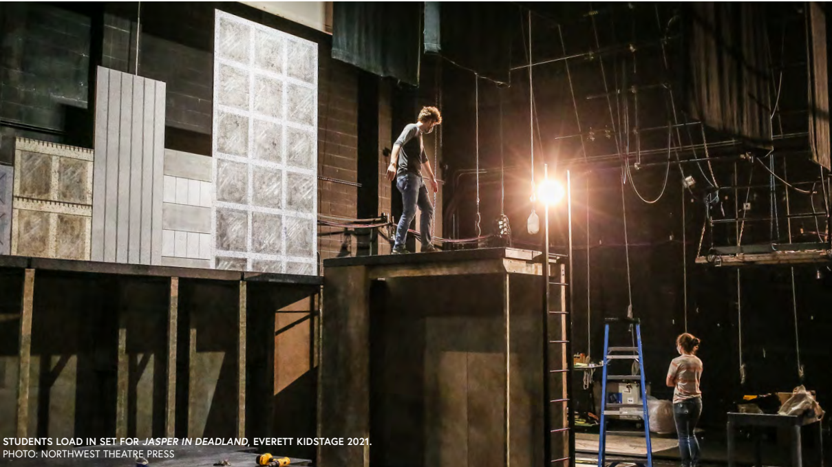
STUDENTS LOAD IN SET FOR JASPER IN DEADLAND, EVERETT KIDSTAGE 2021.