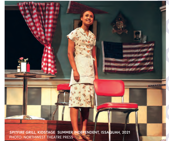
SPITFIRE GRILL, KIDSTAGE SUMMER INDEPENDENT, ISSAQUAH, 2021

KIDSTAGE staff and teaching artists are dedicated to upholding Village Theatre's DEIA goals. They received many hours of training and coaching throughout the year by DEIA specialists. Trainings and topics of focus included: Trauma-Informed Practice, Inclusive Curriculum, Identity-Conscious Casting, and more. Additional trainings were provided by the theatre at large, including: Leading for Racial Equity, Implicit Bias and Stereotypes, Structural Racism, and Courageous Conversations.