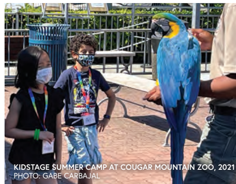
KIDSTAGE SUMMER CAMP AT COUGAR MOUNTAIN ZOO, 2021

We are grateful to the Arakawa Family, The Boeing Company, and Hearst Foundations for their extraordinary support, specifically of our Young Innovators STEM initiatives. Along with our technical training program, their funding provided resources to integrate STEM into KIDSTAGE classes and productions. KIDSTAGE also offered an online class for a local school's science/technology program.